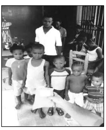
Five kids waiting for bags.